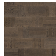
Noble Oak Wasa