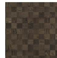
Noble Oak Chelsea