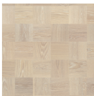
Noble Oak Brooklyn