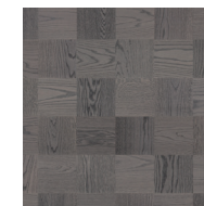
Noble Oak Bronx