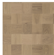
Noble Oak Soho