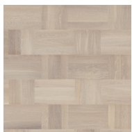
Noble Oak Scandinavia