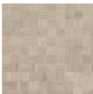
Noble Oak Manhattan