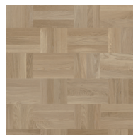
Noble Oak Art Deco