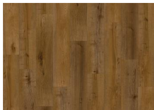
Marrone CLW 228