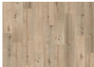
Sabiano CLW 228