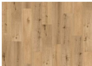
Roan CLW 228