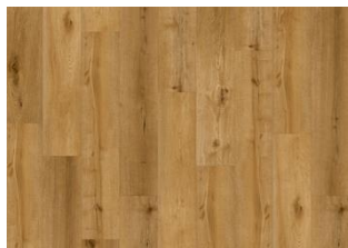
Overo CLW 228